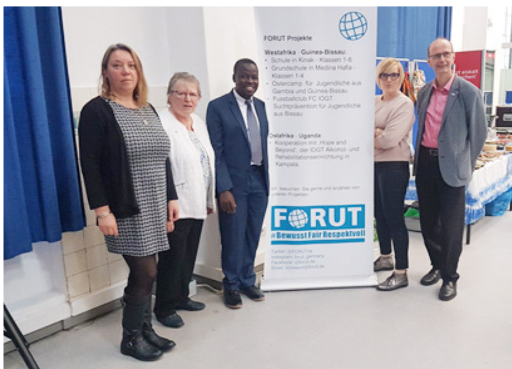
IOGT Germany president (in white jacket), FORUT board members and HaB Executive Director after a presentation on HaB to IOGT Berlin.