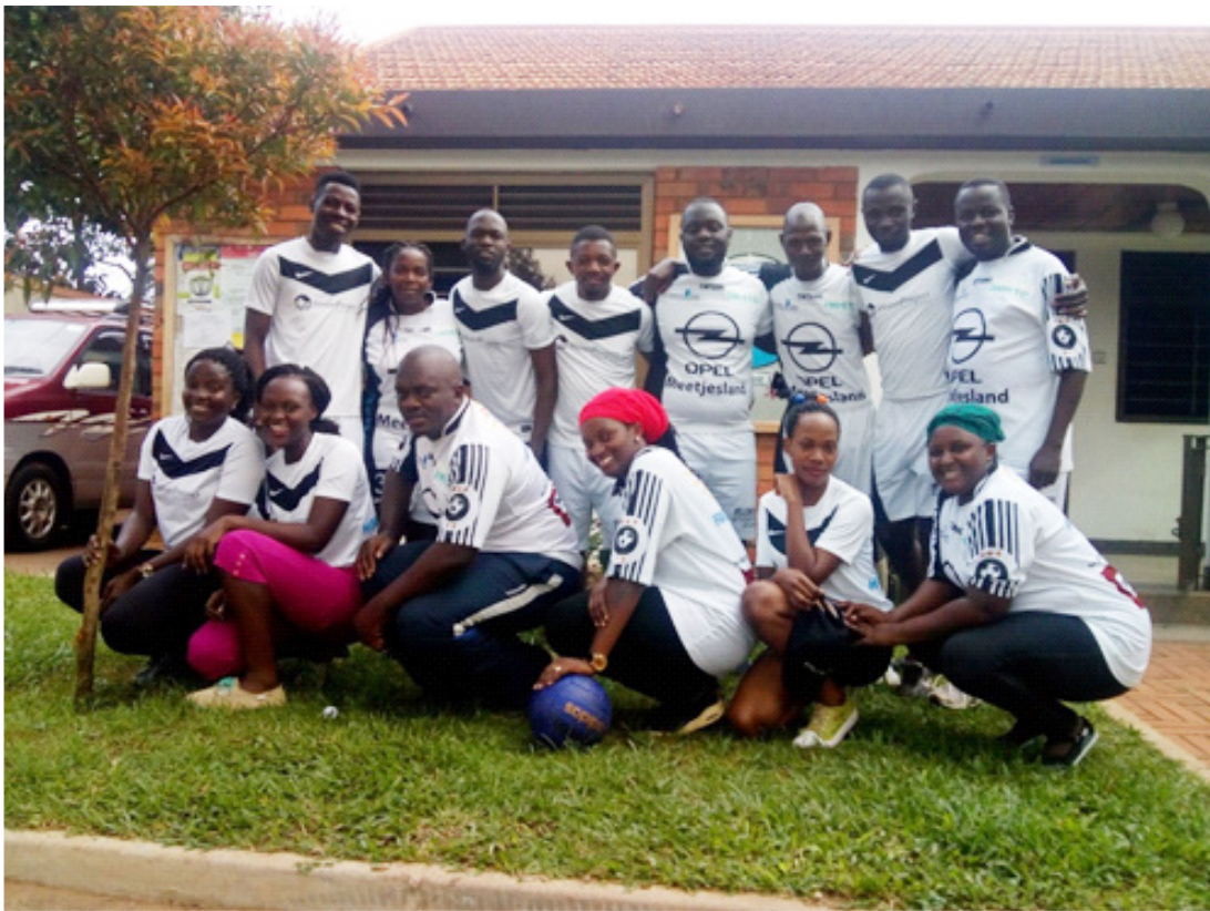
HaB sports team. Sports and games are important components of HaB's recovery activities

The Livelihood and skills building programs such as music, baking and art and craft that were introduced in the reporting period have been much appreciated by clients as some have even taken them on as a source of income during and after treatment. HaB also conducts home visits of discharged clients to support their integration to normal lives.