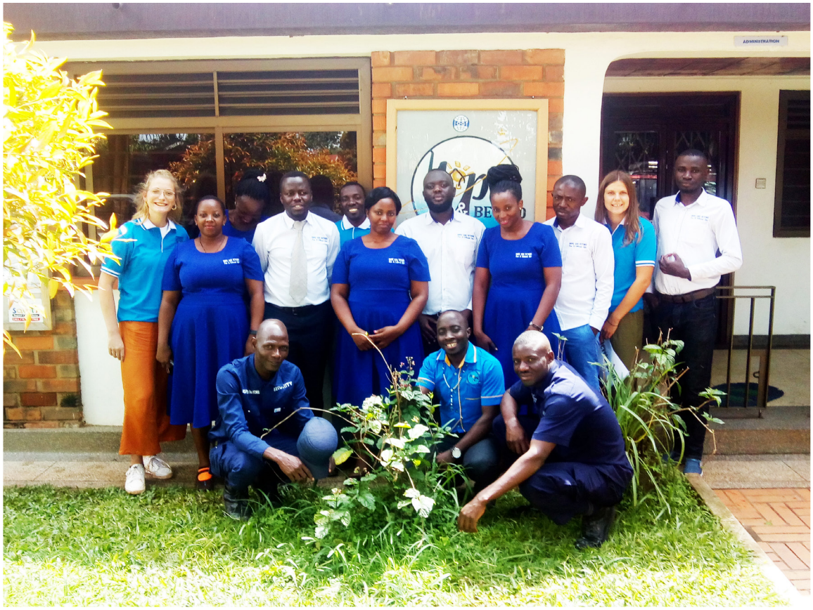
Staff moments: Above, some of the staff members of HaB and