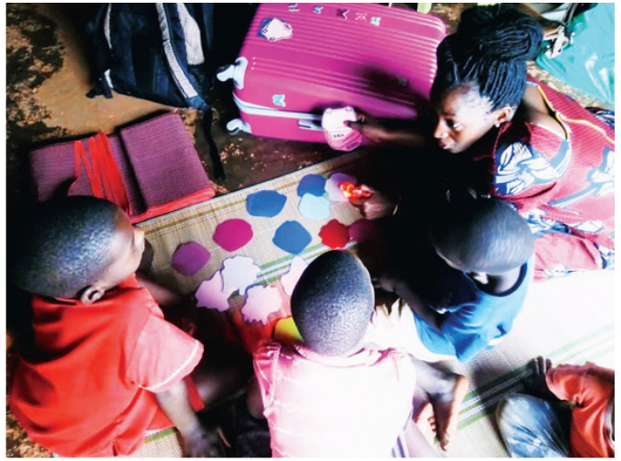
Capacity building (Mengo hospital medics) sessions in progress.