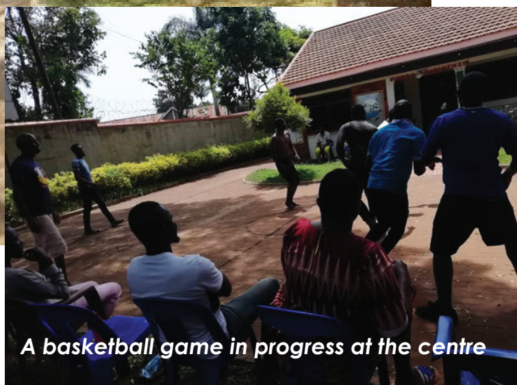
A basketball game in progress at the centre