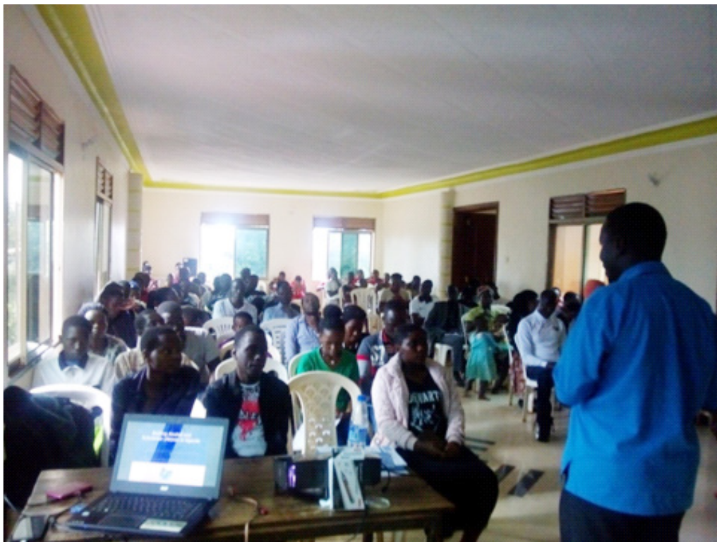
An Outreach session in progress for the youths of St Gyaviira, Bunnamwaya Catholic Parish