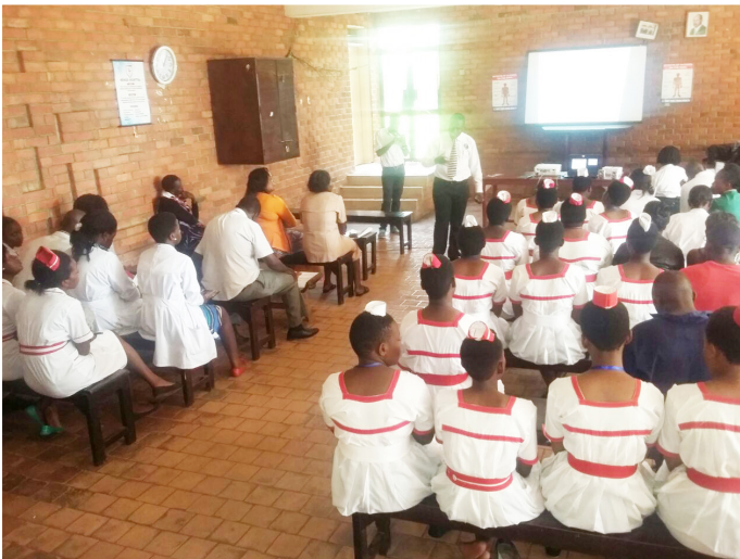
Outreach (Kisigula mosque) sessions in progress.