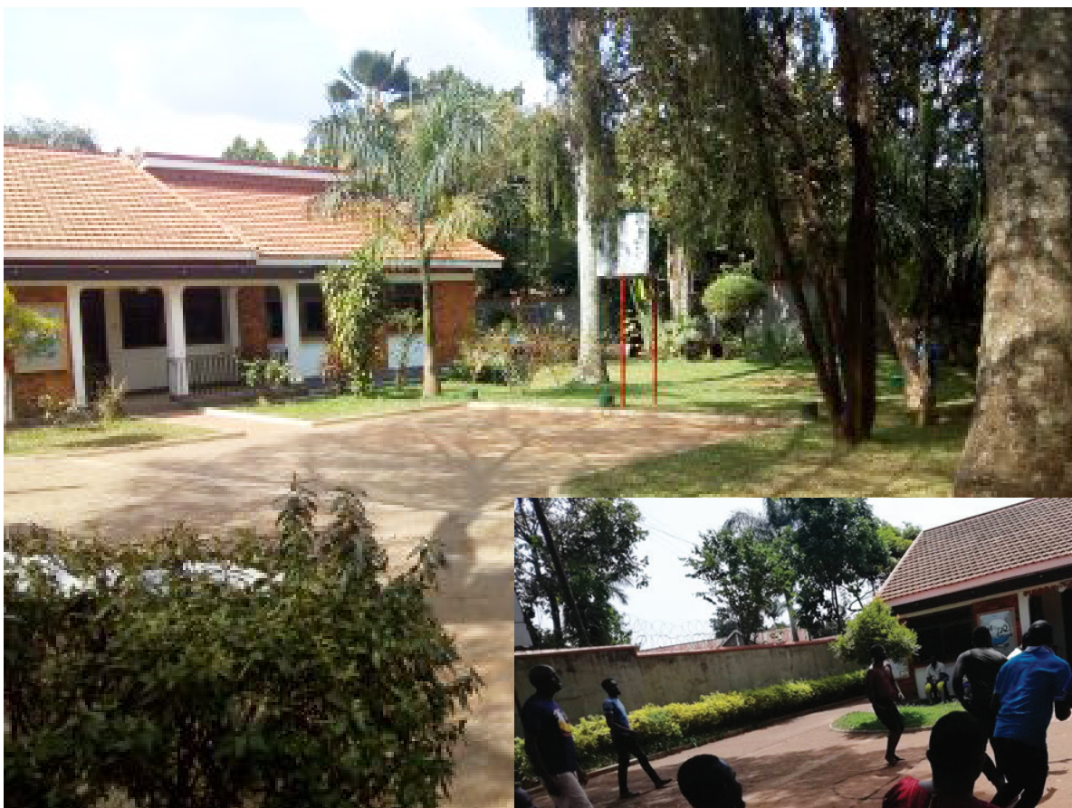
Hope and Beyond rehabilitation Centre's New Home at Bulwa Zone, Wakliga

Treatment Gap: Many of Uganda's health and social service providers are not empowered to provide the needed specialized treatment for substance use. Even the detoxification interventions and addiction counseling rarely reach the low social economic status people and yet they are the ones most at risk.