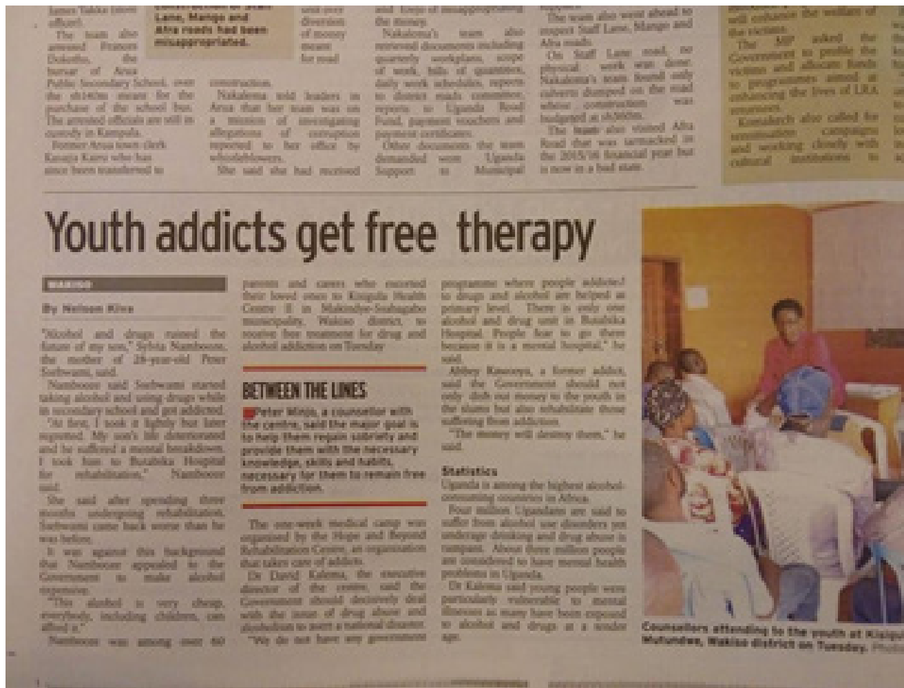
Above is the "The New vision" report about the camp treatment while besides is Poster made to announce the treatment camp