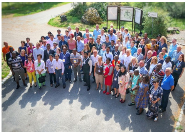
Some of the participants of the 69th IOGT international Congress in Sigtuna, Sweden in 2018